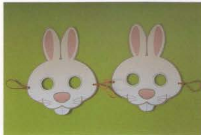
Mask, paper craft materials