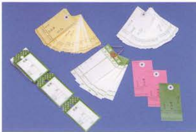
Tags, Hang tags

Synthetic paper (Two Sides Matt or one Side Matt one Side Glossy)