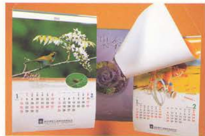
Calendar (yearly or monthly)