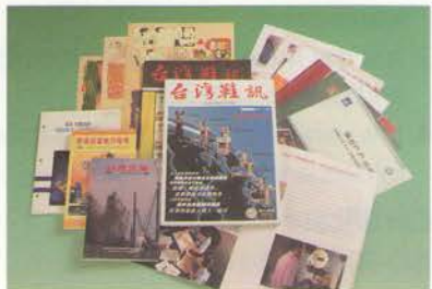
Cover of Book