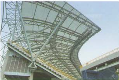
Glue for Outdoor Tent