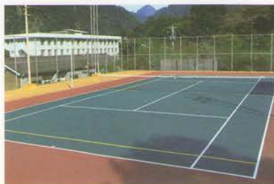
Tennis court installation