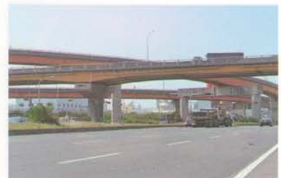
Filing joints of bridge