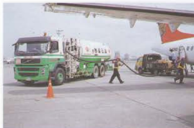
Filling joints of airstrip